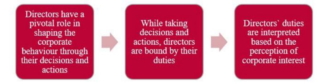
Figure 3 Relationship Between the Key Concepts of Corporate Interest and Directors' Duties

The first identified problem specifically deals with directors' duties. It states that 'directors' duties and company's interest are interpreted narrowly and tend to favour short-term maximisation of shareholders value' (emphasis added). Therefore, it identifies the interpretation of these two concepts ((i) directors' duties and (ii) company's interests) as a single combined cause that favours shareholder interests. It seems like the choice of making a combined statement with these two elements was a deliberate decision.